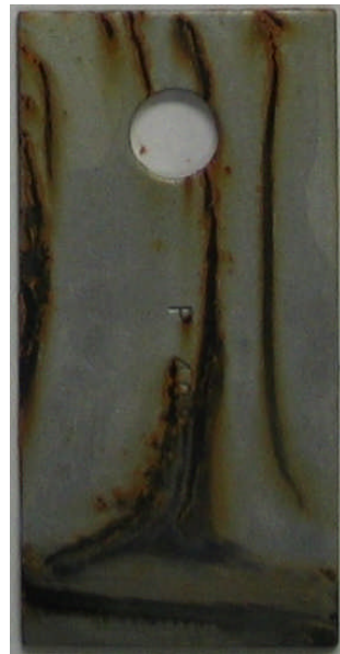
Competitor Product B