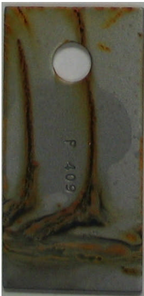
Competitor Product A